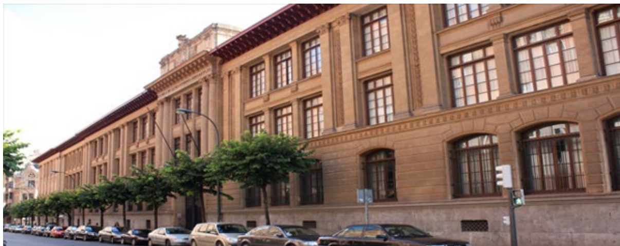
Faculty in Elcano (Bilbao)