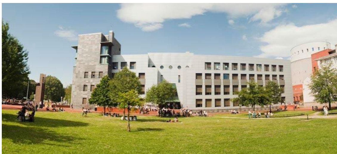
Faculty in Donostia-San Sebastián

We have a Help Centre on each campus. For more information about locations and to make an appointment, please visit our website .