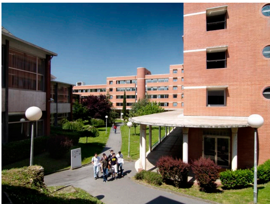
Faculty in Bilbao (Sarriko)

empresa-vi.internacional@ehu.eus +34 945 01 4266 Calle Comandante Izarduy, 23 01006 Vitoria-Gasteiz