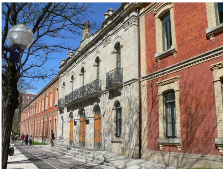
Faculty in Vitoria-Gasteiz

Upon arrival, it is important to visit our Help Centre's so they might help you to have a look at the list, contact the owners and organize student's agenda to visit the flats during your first days in the Basque Country. Our accommodation service incorporates a flats database, "OSTATU" , which the students can already browse from home.